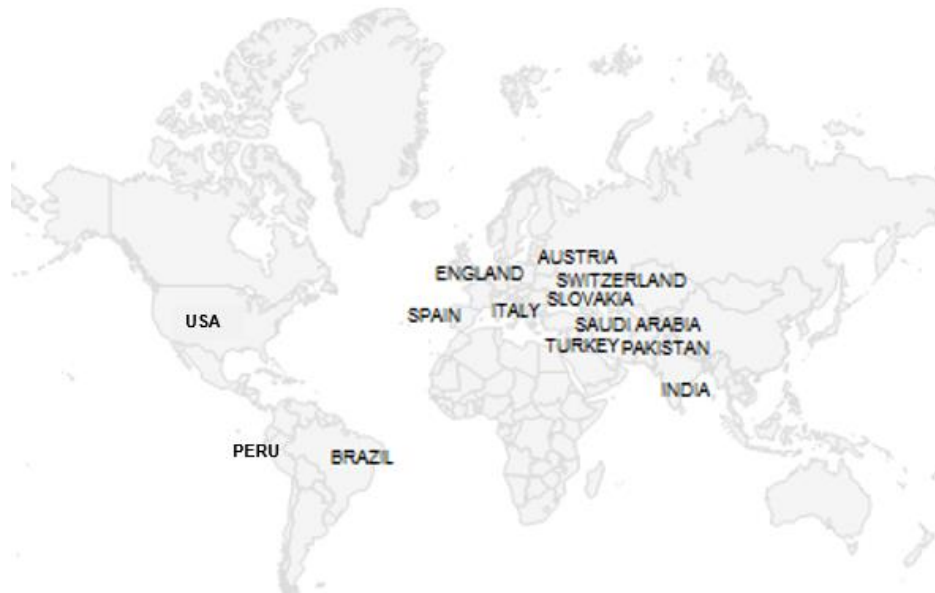
FIGURE 2 - Article publication continents